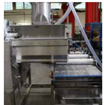
easy accessibility due to extendable components