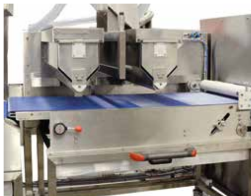
conveyor belt as option